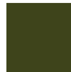
Military Green 1080-M26