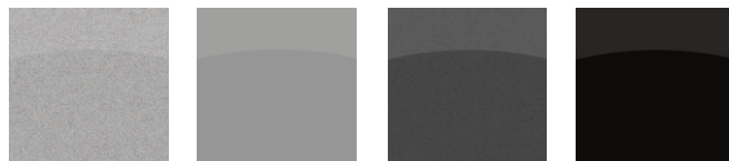
White Aluminum 1080-G120 Sterling Silver 1080-G251 Anthracite 1080-G201 Black Metallic 1080-G212