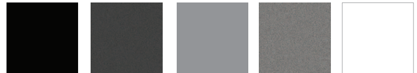
Black 1080-M12 Dark Gray 1080-M261 Silver 1080-M21 Gray Aluminum 1080-M230 White 1080-M10