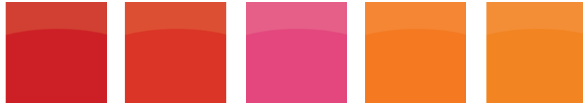
Dark Red 1080-G83 Hot Rod Red 1080-G13 Hot Pink 1080-G103 Burnt Orange 1080-G14 Bright Orange 1080-G54