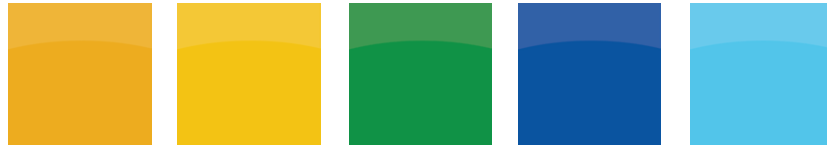
Sunflower 1080-G25 Bright Yellow 1080-G15 Kelly Green 1080-G46 Intense Blue 1080-G47 Sky Blue 1080-G77