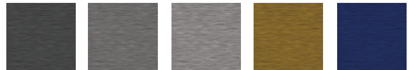
Steel 1080-BR201 Titanium 1080-BR230 Aluminum 1080-BR120 Gold 1080-BR241 Blue Steel 1080-G217

Colors shown on monitor and when printed are approximate representations of actual colors available.